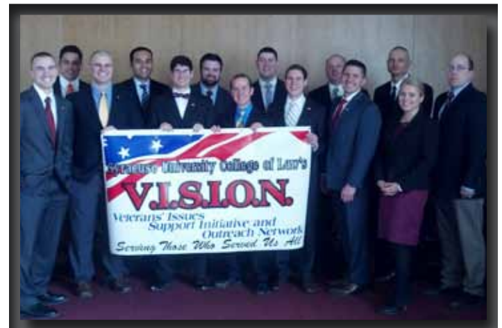
Pictured are law student pro bono volunteers from February's VALOR day.

The VALOR Day event featured a Talk to a Lawyer Program provided by VLP, with eight volunteer attorneys providing pro bono legal advice, information and referrals to 39