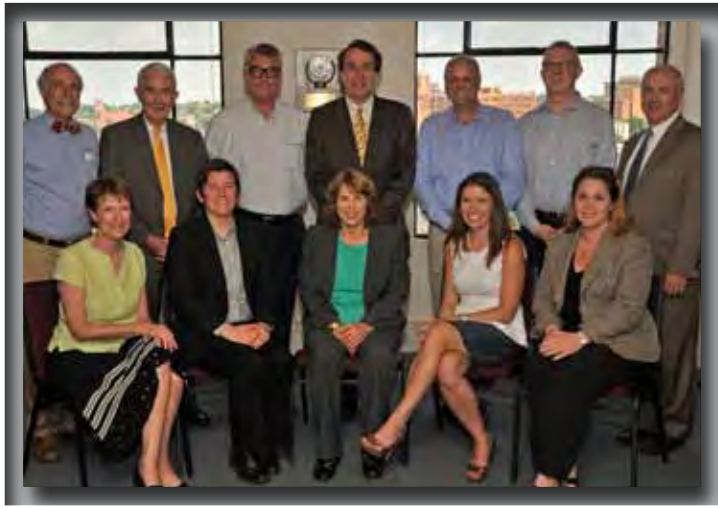
Members of the Executive Committees / OCBA & VLP and Staff:

We wish to thank the hundreds of volunteers from the Onondaga County legal community who have given their time and money to help VLP meet the unmet civil legal