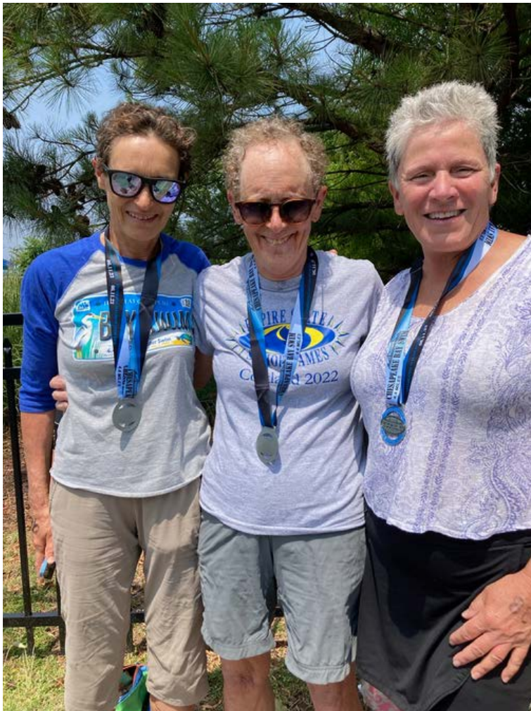
Again the trio is all smiles as they enjoy the medals they each received for completing the 2023 Great Chesapeake Bay Swim.

“The thing about physical activity when it’s done, it’s done. And you go swim across a bay, or you go on a 112-mile bike ride as part of an Ironman and then when you’re done you feel like you don’t have to go back and edit it. I don’t have to revise it. I don’t have to think about the question I could have or should have asked in the deposition -- it’s just done. And I find the act of, on some levels, the mindlessness of swimming to be a very good way to process information. And I can’t tell you how often I get out of the pool or finish a swim and say, ‘you know here’s how to structure that argument.’ It comes together while you’re not thinking about it.”